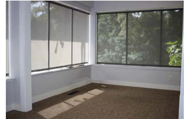
Large Corner Office or Two Medium Sized Offices