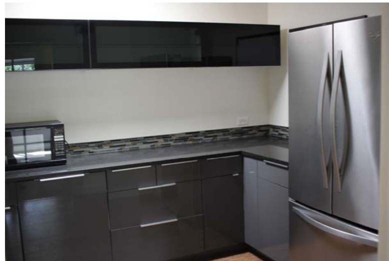
Private Kitchen with Refrigerator, Microwave & dishwasher