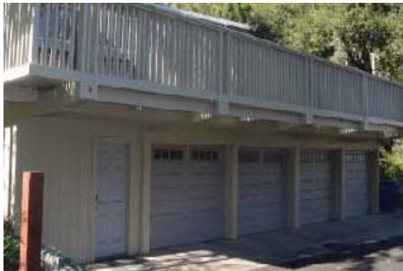
Private Garage (two spaces)