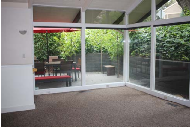
Spacious Front Lobby