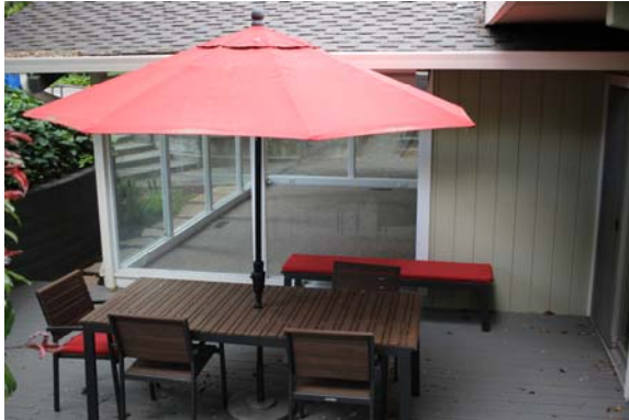
Private Patio with Furniture