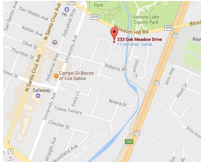
Located in Downtown Los Gatos