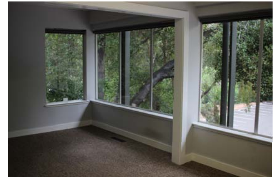
Large Windows in Each Office