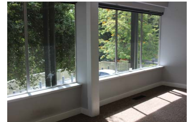
Large Office Windows